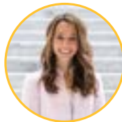
Abby Cox First Lady of Utah